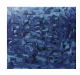
Painting No. 3