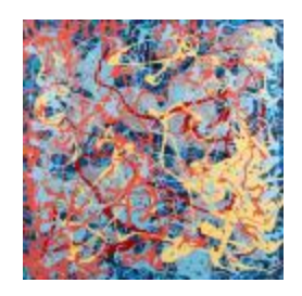
Painting No. 30