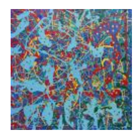
Painting No. 31