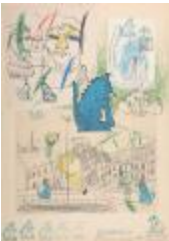
Blue dogs of arrangement