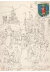
Highlander likes vodka