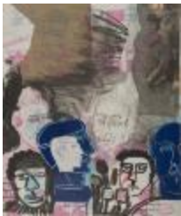
Crosses - Tanks