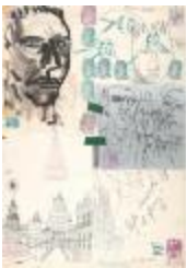
Fish smells from the head