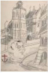
Spotted Head in the City