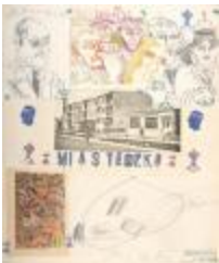
New secretary in town