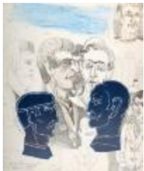
I believe in them