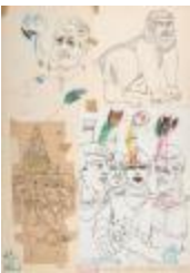
Four days of congress