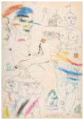
A bit fallen girls