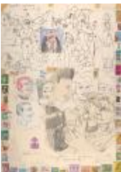
Christ in the grave