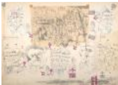
Murder stupid bastard