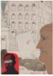
Gryps (secret note from prison)