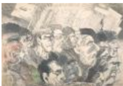
Procession of paupers