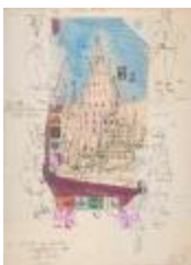
Willa dei Misteri