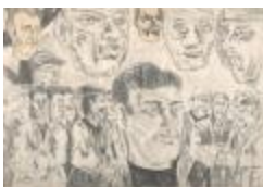
Conversations - Discussions