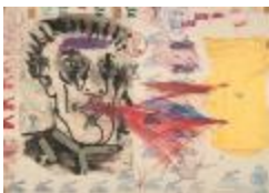
Reasons of State