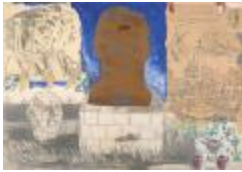
There will be new monuments