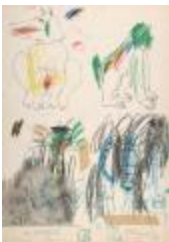
Boys after boys