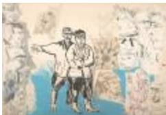
Pissed off worker