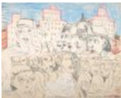
Victoria - a foreign -12.01.79 - Pola's birthday