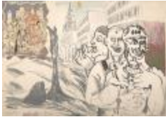
Mother under the cross