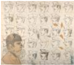
Extended backup service