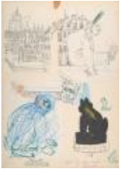
I have grown horns