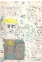
Never more December