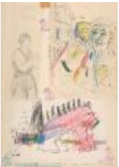
Not only Solidarity