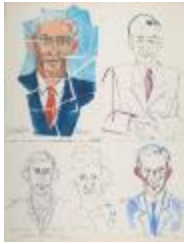
Man of the year - Jerzy Buzek