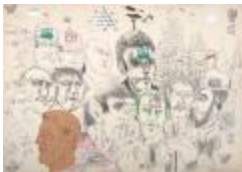
Communism is the curse of the people