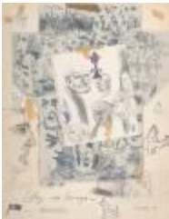
Faces on the cross