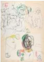
Head and Shoes