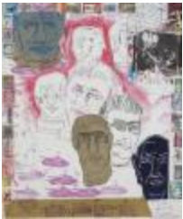
They want tanks