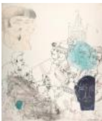
Solidarity and Watchmen