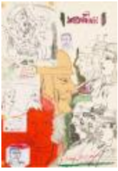
I'm the prime minister