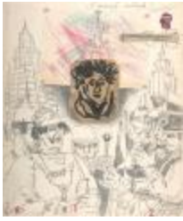
For the memorial to the dead