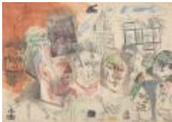
New SB juvenile fish