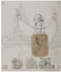
Strike - Victoria