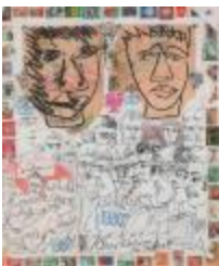
The working class don't wait