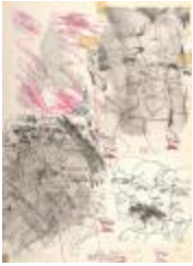
There will be a war