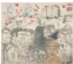
These Prole Faces