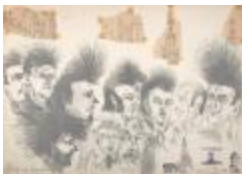
We have our hairstyles