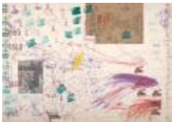
Letters to management