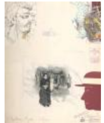
With a Chaplain, With a God, With a Tank