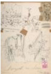
Christ in the street