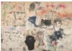
My heart hurts