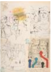
Last cigarette on the loose