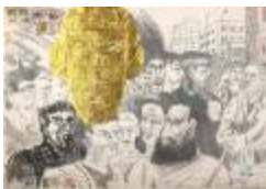
Conversations - Golden decisions