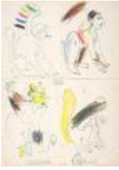
Boys after girls