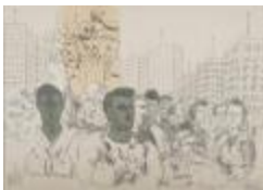
A Free Rabble