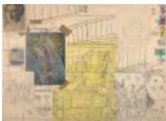
Stairs of happiness