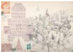
Not much bread here