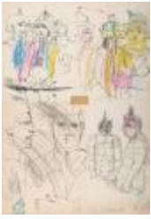
All with God