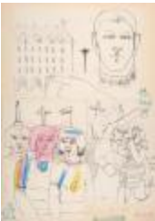
Everyone according to talent