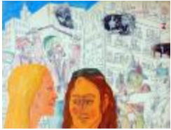
Elihu and Elifaz