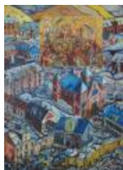
Railway station waiting room in Rypin