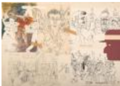
Machine industry workers