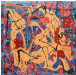
Painting No. 167