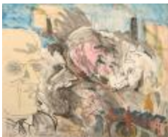
Arrest in Koszalin