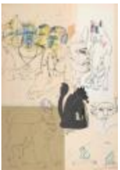
Ours are watching