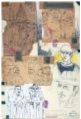
Agitation in villages and cities