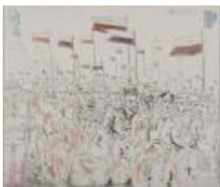
Before the song