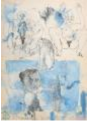
Boy and Girl