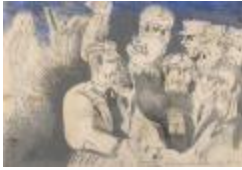
Two hundred and forty-four days