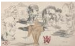
Glory to the Heroes