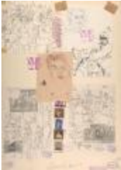
Chanel number 5