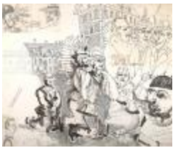
Two big pigeons of peace