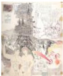
Streets - Universities