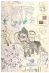
Working class on the streets