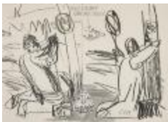
The Good Samaritan