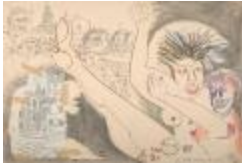
On Saturday we go to the widow's house