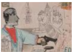
Death of the Leader