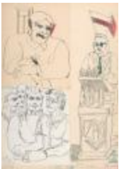
Before the congress