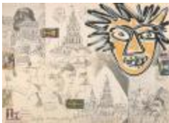
Constant conversations, tenders, discussions