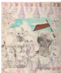
We have a new leader