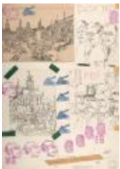
Comfort of power