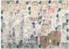
Still those Faces