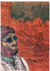
Barabbas and the woman