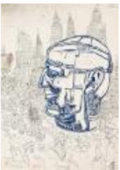
A Beautiful Master in a Beautiful City