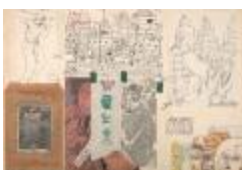
Liberation movement from the working class