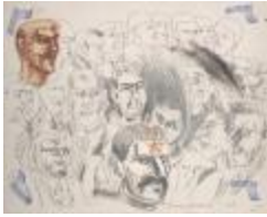
Bloody Paranoid and Former Prisoners