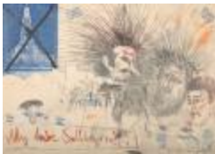
My love Solidarno??