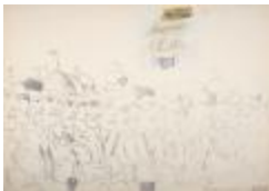
Poverty and Exploitation