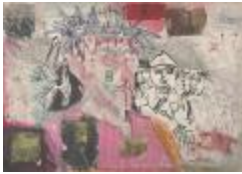
We Have a Pope