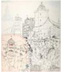
Wa??sa in Silesia