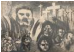
Mi?tne Students Strike of 1984