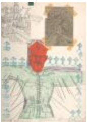
Miracle on the Vistula River