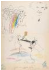
My head is splitting