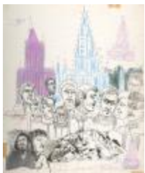
Boredom of the provincial city of Warsaw