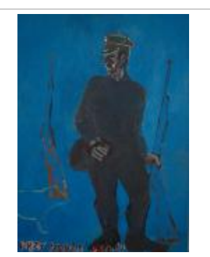
Weapon by the Leg