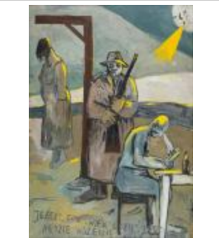
"If something exists in one place, it will exist everywhere"