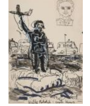
Big worker and little whore