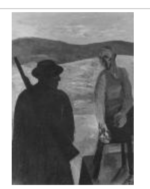
They Murder Here