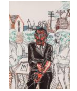
At the seaside