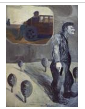
To Have or to Be?