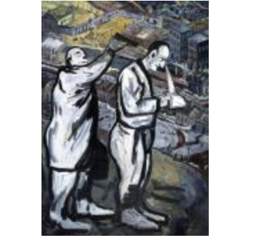
A Bourgeoisie Revolution (Second Version)