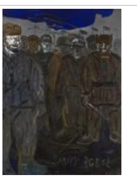
A Killed Prole II