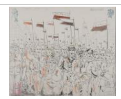
Before the song