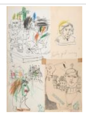
Everyone is important