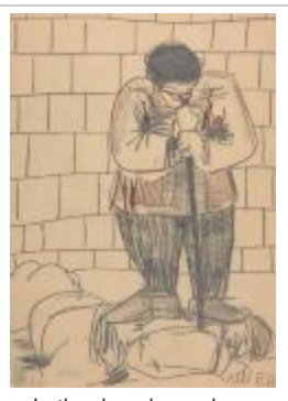
In the dung knee-deep