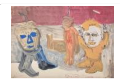
Head and legs