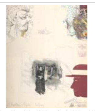
With a Chaplain, With a God, With a Tank