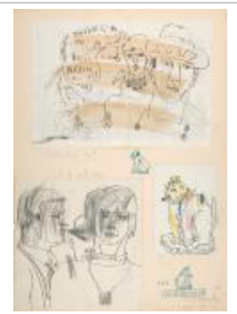
Listen! No, You listen!