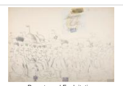
Poverty and Exploitation