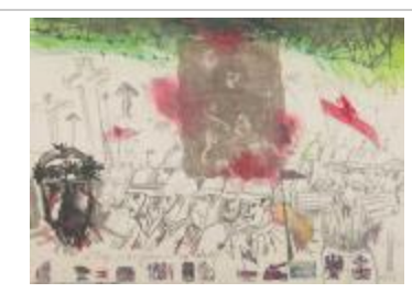
Three generations - Three dates