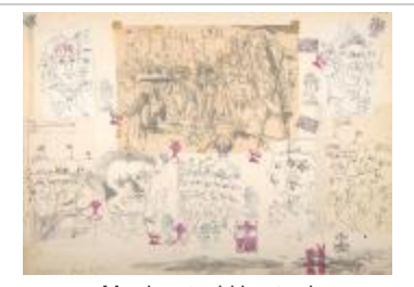
Murder stupid bastard