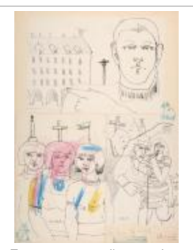
Everyone according to talent