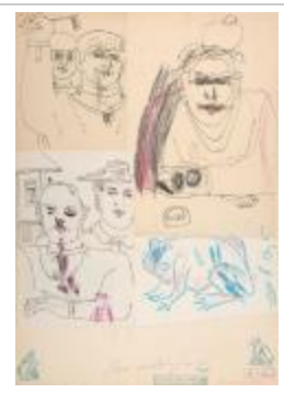
New chiefs in the countryside