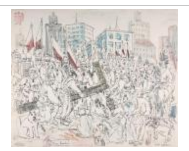
We Have a Prophet