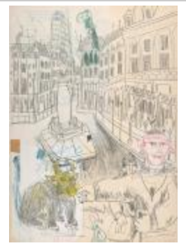
Cow in Downtown