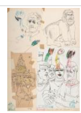
Four days of congress