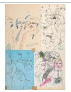
Before the congress forums