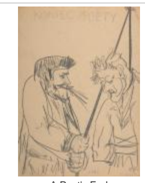
A Poet's End