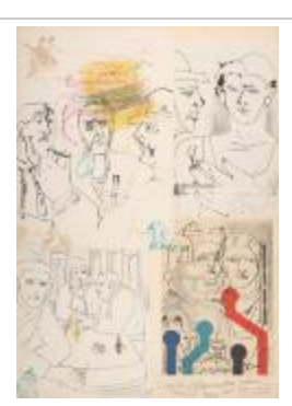
Last cigarette on the loose