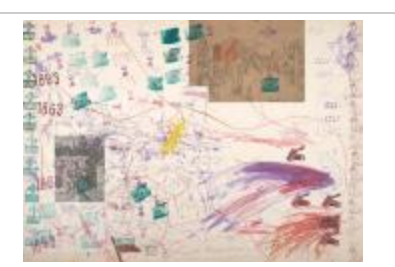
Letters to management