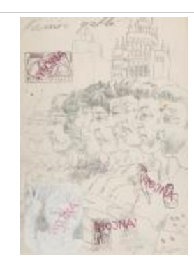
End of chat