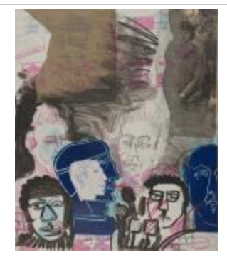
Crosses - Tanks