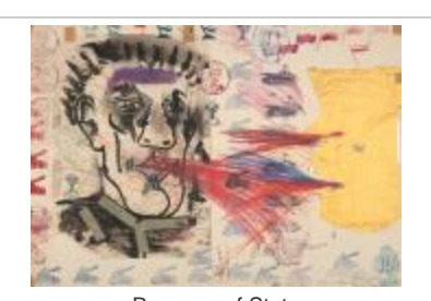
Reasons of State