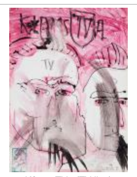
K?amsTVa (TV lies)