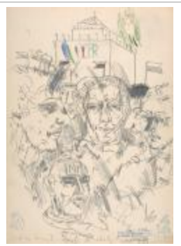
The congress is over - proles go to work