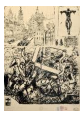
Christ in the city