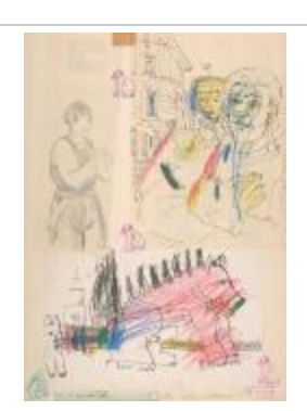
Not only Solidarity