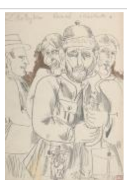
I got a piece of carcass