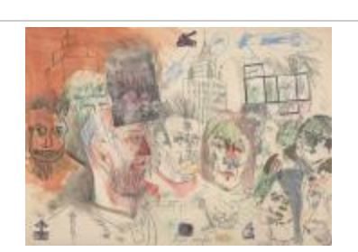
New SB juvenile fish