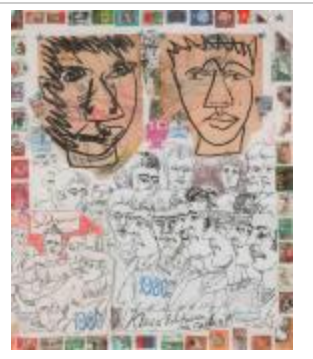
The working class don't wait