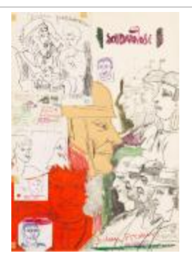
I'm the prime minister