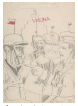
Complete the instructions