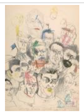
The first day of the congress