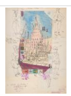
Willa dei Misteri