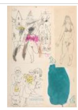
Women - heroes