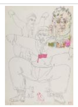
There will be a war