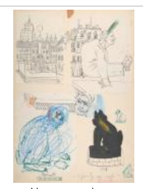
I have grown horns