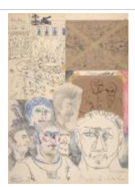
Friends from Gda?sk