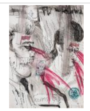
K?amsTVa (TV lies)