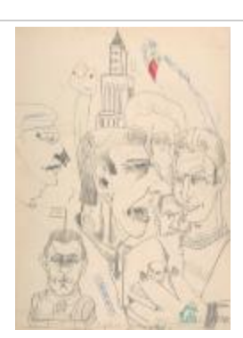
Socialists - Communists