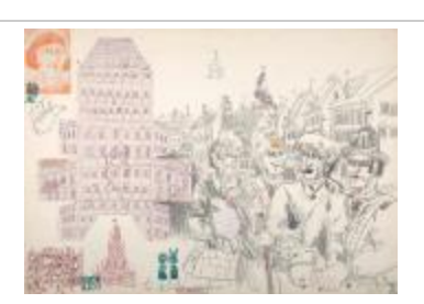
Not much bread here