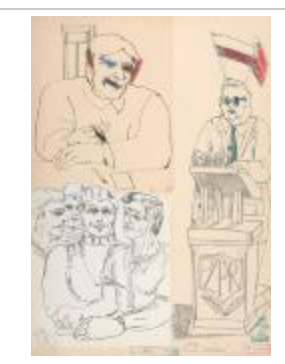
Before the congress