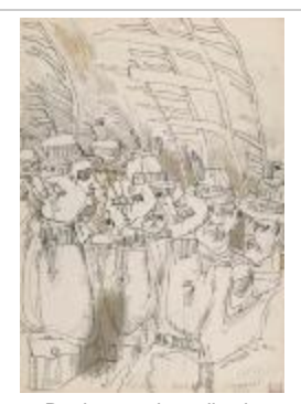
Bushes and reedbeds