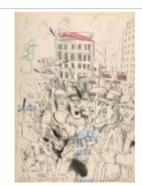
KKP - deliberates!