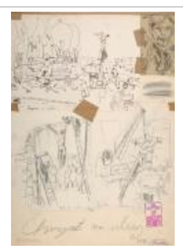
Christ in the street