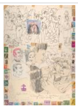
Christ in the grave