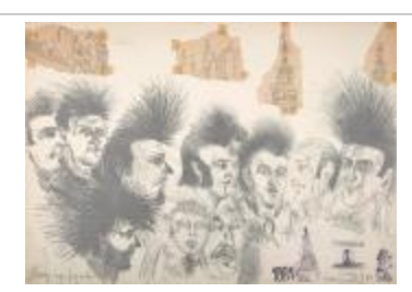
We have our hairstyles