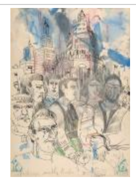
Hope the mother of the party