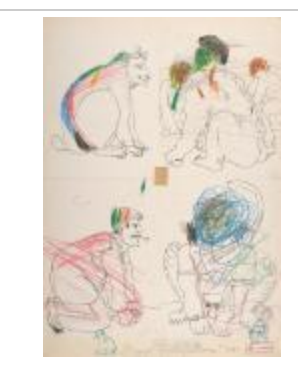
Position of faith and renunciation