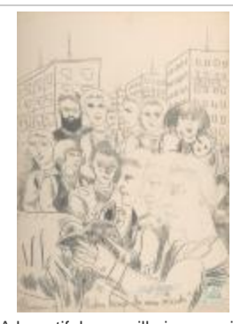
A beautiful cow will give us milk