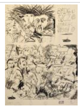
Bydgoszcz Brass Knuckles