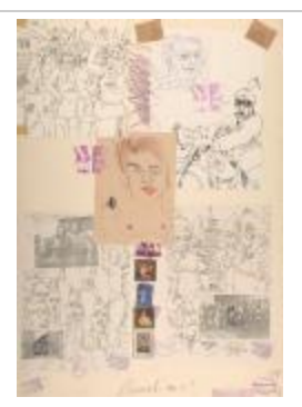
Chanel number 5