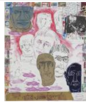
They want tanks