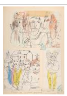
The police have a serious gaze