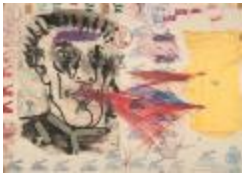
Reasons of State