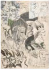
Long Live War!