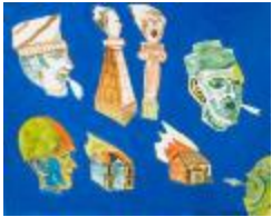
Let the war live!