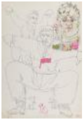
There will be a war