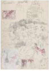
End of chat