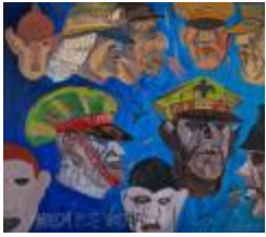
Long Live War