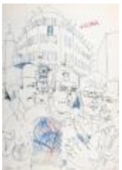
Frost minus 15-C