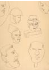
Let the war live!