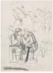
The Worker of War