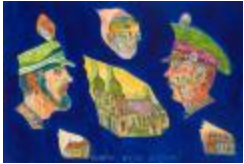
Let the war live!