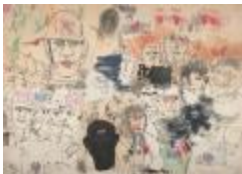
My heart hurts