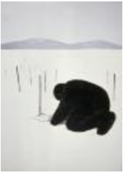
Vorkuta - cemetery I