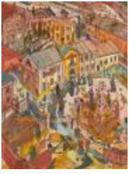
Kutno - Town hall