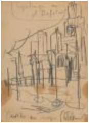
Execution in the Parade Square