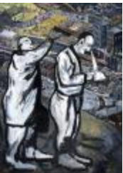
A Bourgeoisie Revolution (Second Version)