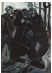
To Kill a Priest