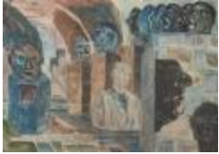
Stable in Koz?ówka