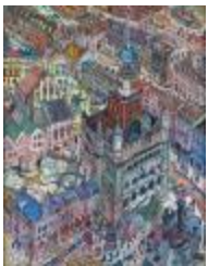
Poznan - Sun Gallery