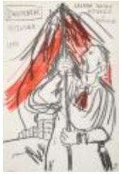
Edward Dwur-nik, Drawing. Poster for the exhibition