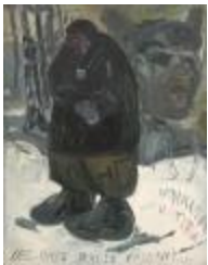
Fly, eagle, break the chains