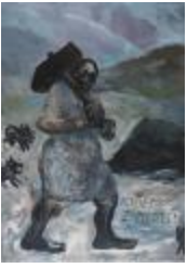
Woman with a Hammer