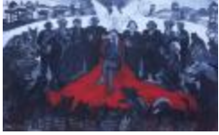
Constitution of May 3