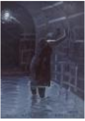
Zofia Majewska - bunker - Brygidki - Lviv