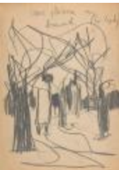
Gray coats in the trees