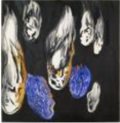
The "Ghetto" Triptych (Warsaw, April 19, 1943)