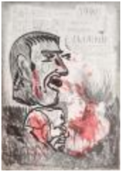
Edward Dwur-nik, Pain-ting: 25 Realist Pain-tings. Poster for the exhibition