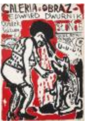
Edward Dwurnik. Sun. Poster for the exhibition