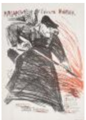
Edward Dwurnik. Pain-ting: Wor-kers, Hit-ch-hiking Jour-neys. Poster for the exhibition