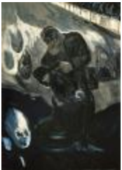
Consolidation of people's power 1945 - 56