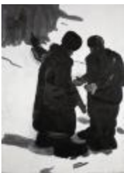
Intelligent on the left - Worker on the right