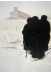
Vorkuta - cemetery III