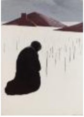
Vorkuta - cemetery II