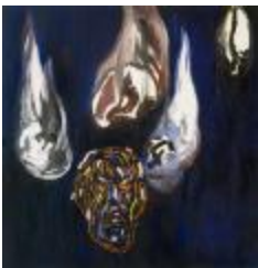
The "Ghetto" Triptych (Warsaw, April 19, 1943)