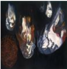
The "Ghetto" Triptych (Warsaw, April 19, 1943)