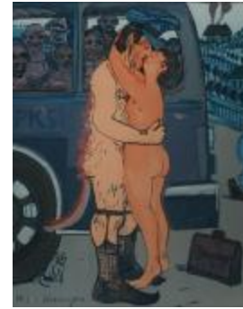
PKS and a girl