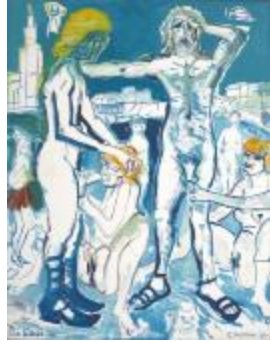
For Kasia Bajo-Piekut