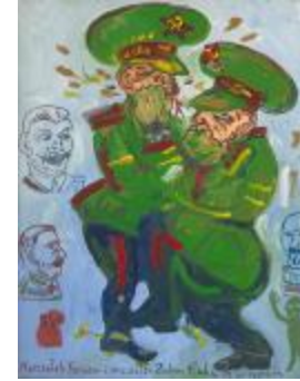
Marshal Konev and Marshal Zhukov are punching each other in the face