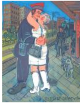
State railway worker