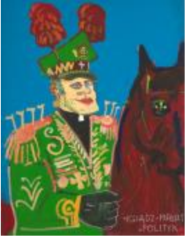
Priest - Prelate - Politician