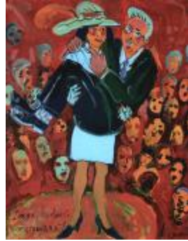
Second term assured