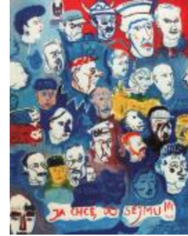
I want to go to the Sejm