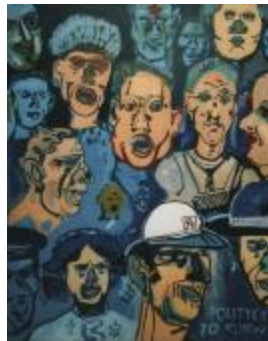
Politicians are whores