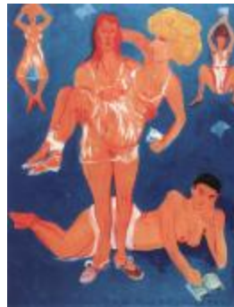
Young Polish writers