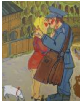
Postman in love