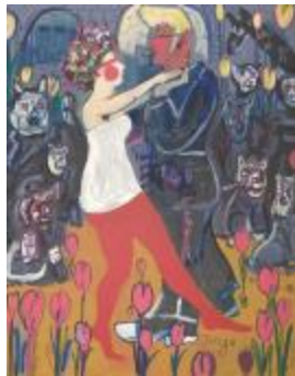
Director's Tango in Bielsko