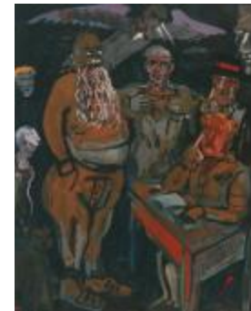
In the editorial office of Twórczo??