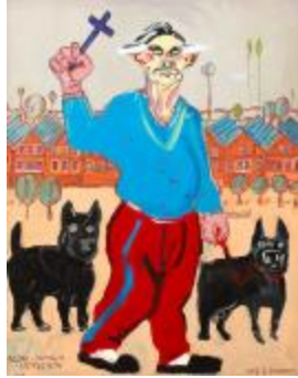
Pole - Catholic - Anti-Semite