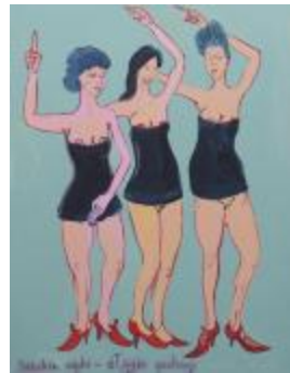
Narrow pussies - Long vaginas