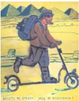
Newspapers are garbage, I'm going to Bieszczady