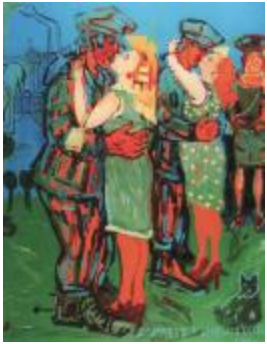
The girl and the soldier