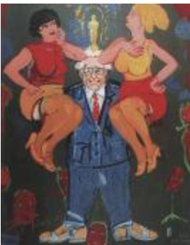
Film director (A. Wajda)