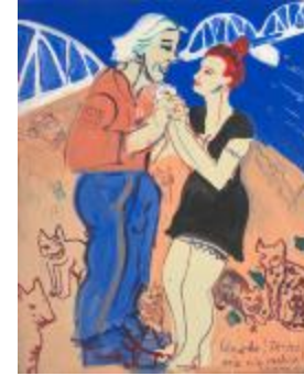
Eduardo! Fuck me to the max!!