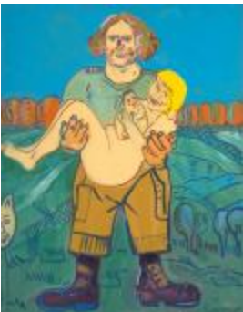
Dunin - Mas?owska