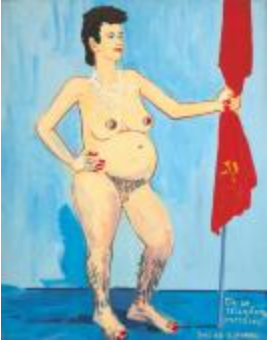
Ela with the banner of the future