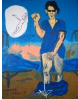
Curator, you pig!