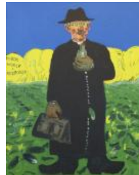
Cork, bag and slit