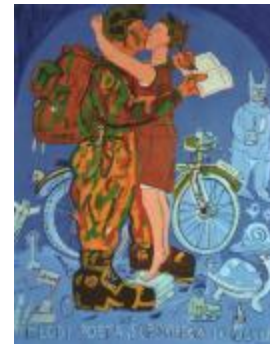
A young poet of the middle generation