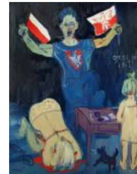
Father drank and beat