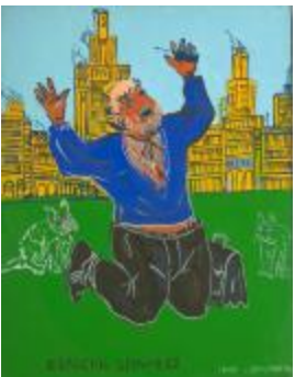
Secret police confession