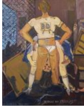
Don't shoot yet!!