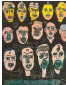
Pray, fuck, steal