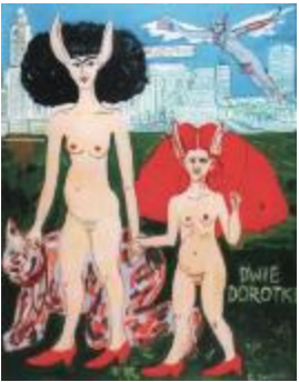
Two Dorothys - orphans