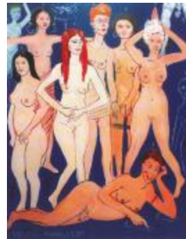
Sisters of the avant-garde