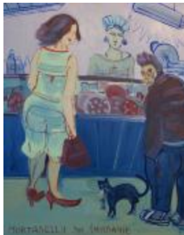
Mortadella for breakfast