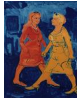
How, ma'am? Okay, ma'am!