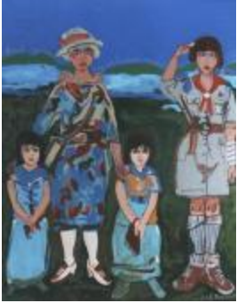
The hardship of life or a chilled Orvieto?