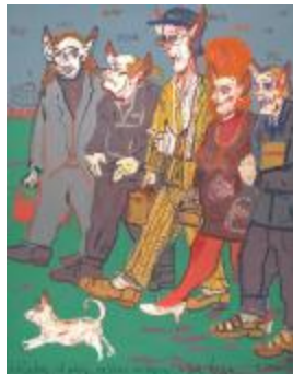
Exactly as if today in this country