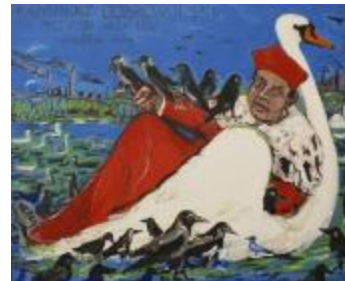
Rector of the University of Warsaw