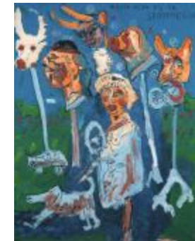
The rabble is pushing towards the city center