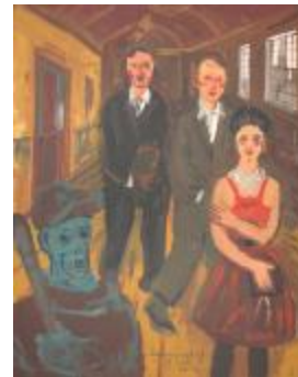
Life imprisonment, which is 25, which is 15, which is 10