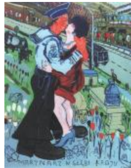
A sailor in the backcountry